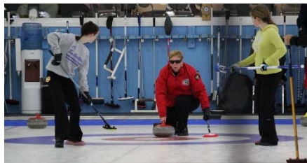
Youth volunteers act as designated sweepers for Visually Impaired Curlers

OCC provided support to the Wheelchair Curling Athletes through the hosting of the Ontario ParaSport Championships – during that Championship, run jointly with ParaSport Ontario, OCC was able to include a division of Visually Impaired Curlers.