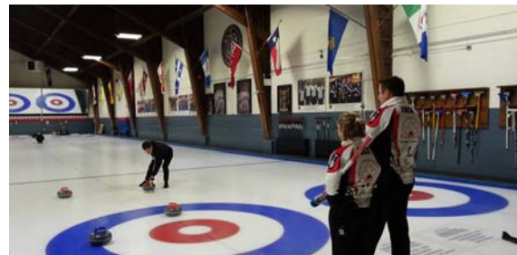
Mixed Doubles teams heading to Nationals receive training at a "Get Ready for Nationals Camp"

OCC has identified several coaches with an interest in Mixed Doubles and have provided development support for them.