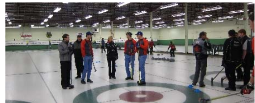
Next Gen Teams received instruction from Curling Canada's National Coaches at a camp held in October 2015