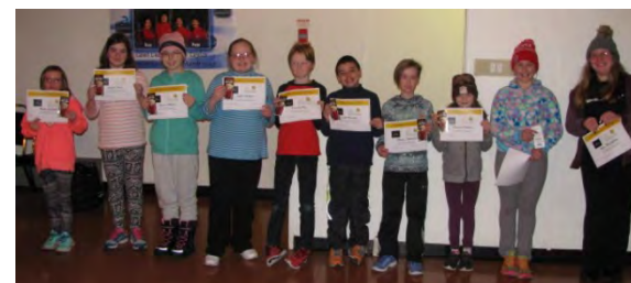
Kenora Curling Club winners