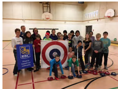
Rocks and Rings and Curling 101 in Kenora