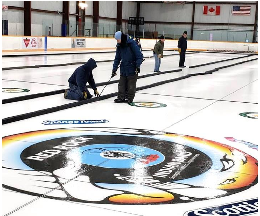
ICE INSTALLATION IS CURRENTLY UNDERWAY AT THE NIPIGON ARENA